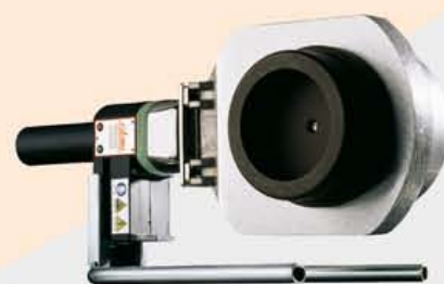
R 125 Q