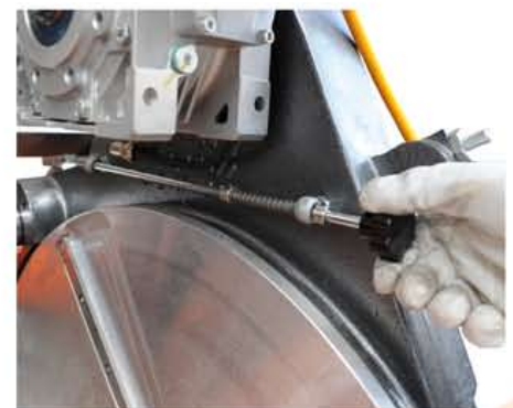
Fast removing system