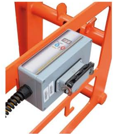
"Digital Dragon" temperature controller