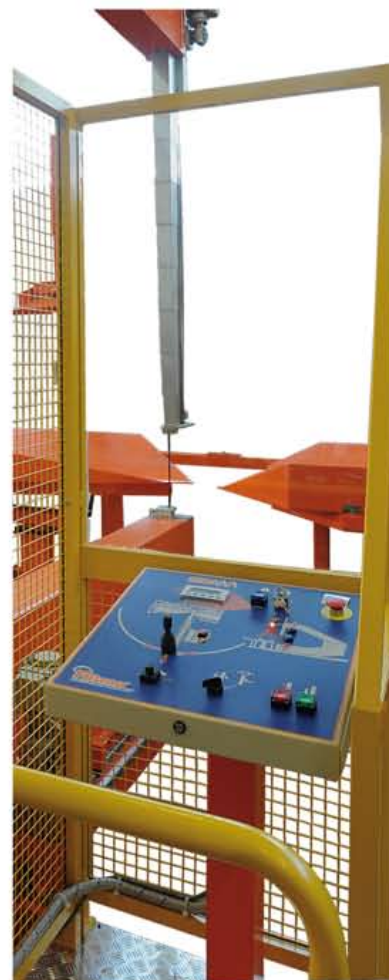
Operator control cabin