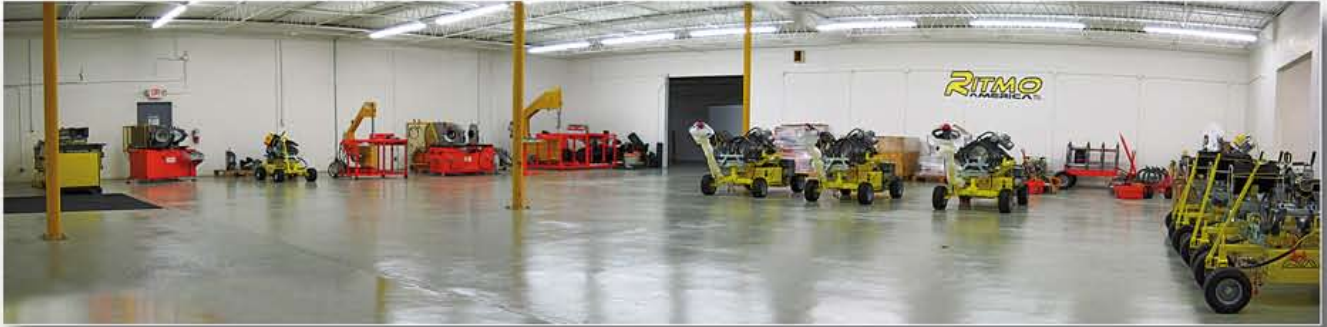
Ritmo America LLC - FL